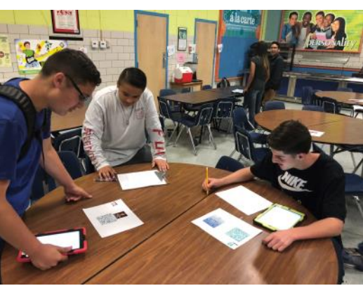
Coronado and Estacado 8th Grade students participating in a two day Science and Social Studies STAAR Boot Camp. Stations were organized by teachers to help students review essential content on Monday and Tuesday before the STAAR Assessments.