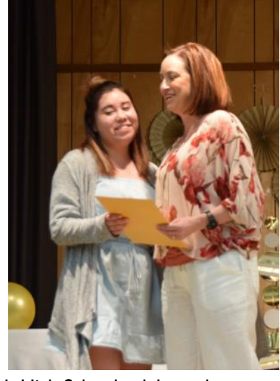
Ash High School celebrated graduating seniors with a scholarship and awards banquet.