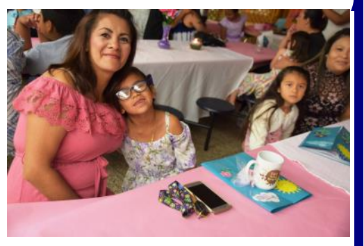
Thunderbird second grade students invited their mothers to a tea in celebration of Mother's Day.